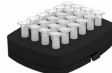
Micro Centrifuge Tubes CAT. NO. # VM-A4