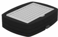
Microplate CAT. NO. # VM-A2