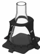
Flask CAT. NO. # VM-A3