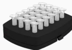
Micro Centrifuge Tube 20 x 1.5/2ml